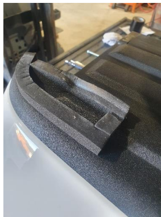
REAR CORNERS OF TUB