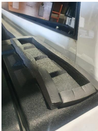
FRONT CORNERS OF TUB