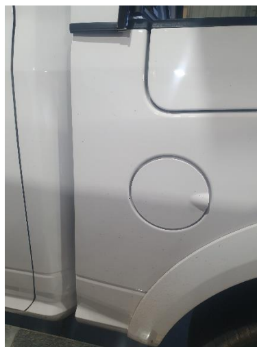
UP UNDER THE BODY IN FRONT OF THE FUEL FILLER