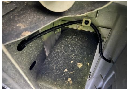
RUN WIRE FROM CHASSIS INTO VEHICLE FLOOR

USING THE LEFTOVER WIRING, USE THE SOLDER SPLICES TO JOIN THIS WIRE TO THE CENTRAL LOCKING WIRES OF THE CANOPY. RUN THE WIRING THROUGH THE CHASSIS TO THE CLOSEST EXIT HOLE NEAREST THE PASSENGER SIDE REAR DOOR. OPEN THE PASSENGER SIDE DOOR, UNCLIP THE B PILLAR COVER PLATES AND EXPOSE THE WIRING. YOU WILL NEED TO DRILL A HOLE IN THE FLOOR OF THE VEHICLE TO ALLOW THE WIRING TO COME INSIDE. ONCE YOU HAVE FINISHED WIRING, YOU WILL NEED TO SEAL THIS HOLE USING SIKAFLEX OR SILICON. CONNECT THE TWO MALE SPADE CONNECTORS TO THE ENDS OF THE CENTRAL LOCKING WIRES, THEN CONNECT THE PURPLE SPICE CONNECTORS TO THE CENTRAL LOCKING WIRES OF THE CAR (PICTURED BELOW).