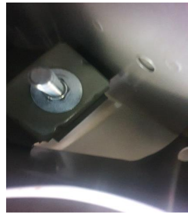
HOLE IN LIGHT CAVITY ONCE CANOPY IS BOLTED DOWN