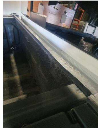
FRONT EDGE OF TUB

(If there are any gaps in the front corners of the tub, make sure you seal them with a sealant before you fit the canopy to prevent any water leaks.)