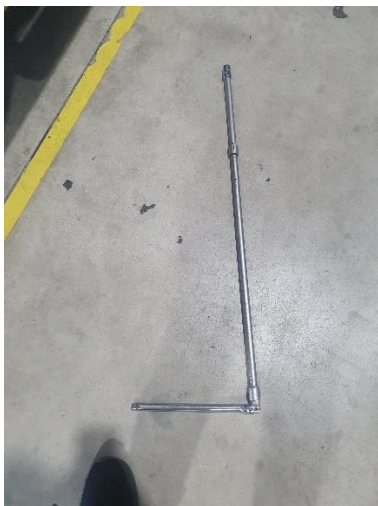
EXTENSION BAR SOCKET