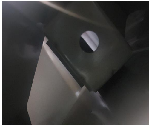
HOLE IN LIGHT CAVITY